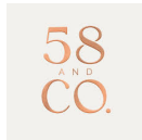
58 & Co. 7 miles from OHP