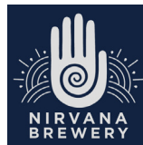
Nirvana Brewery 11 miles from OHP