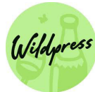
Wildpress Orchards 126 miles from OHP