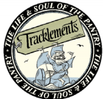
Tracklements 91 miles from OHP