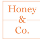
Honey & Co. 5 miles from OHP